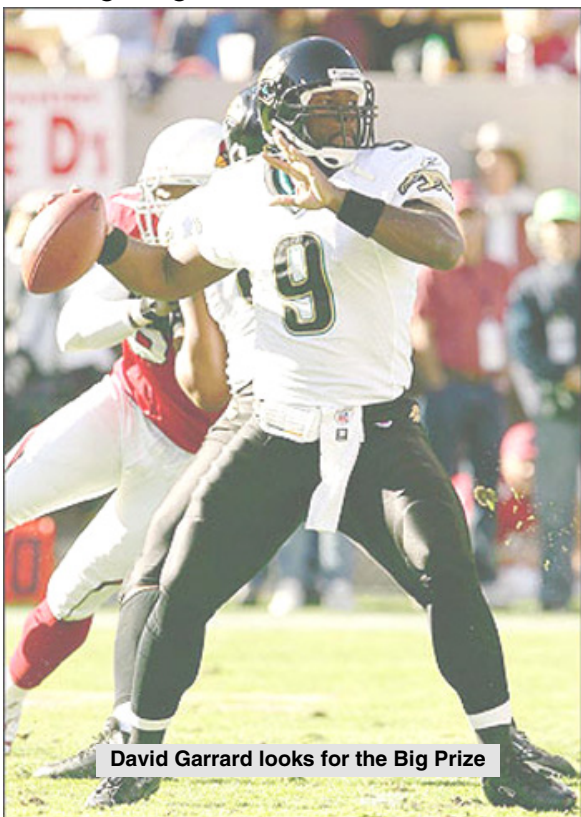
David Garrard looks for the Big Prize

fect season. The Indianapolis Colts are hoping for a full recovery of Marvin Harrison and the Pittsburgh Steelers of Willie Parker. The championship of the AFC will come down to four teams, the Patriots, Colts, Jaguars, and Chargers. Each team has already laid claim to being the best in the AFC.